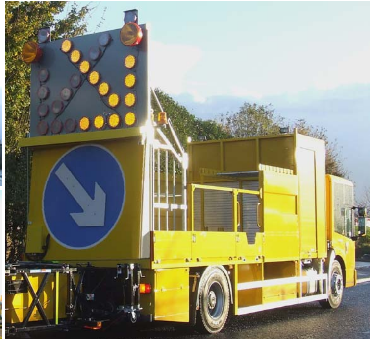
Red Cross Light Arrow - Folding Top Panel (with optional integral sign plate rack on an ISU body)

Chapter 8 of the Traffic Signs Manual now includes a new procedure, the “Mobile Carriageway Closure Technique” for temporarily closing the carriageway completely, allowing road works operatives to carry out their duties in a safe traffic free zone, whilst the traffic is slowed to a controlled halt and then briefly held at a standstill.